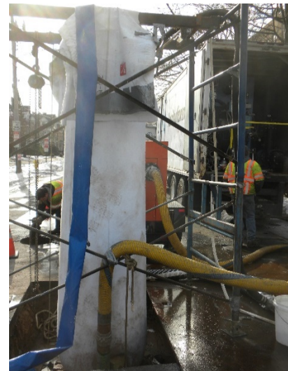
Insertion of Pipe Lining

*Due to dynamics of construction schedule, weather and other factors, dates and times are subject to change.